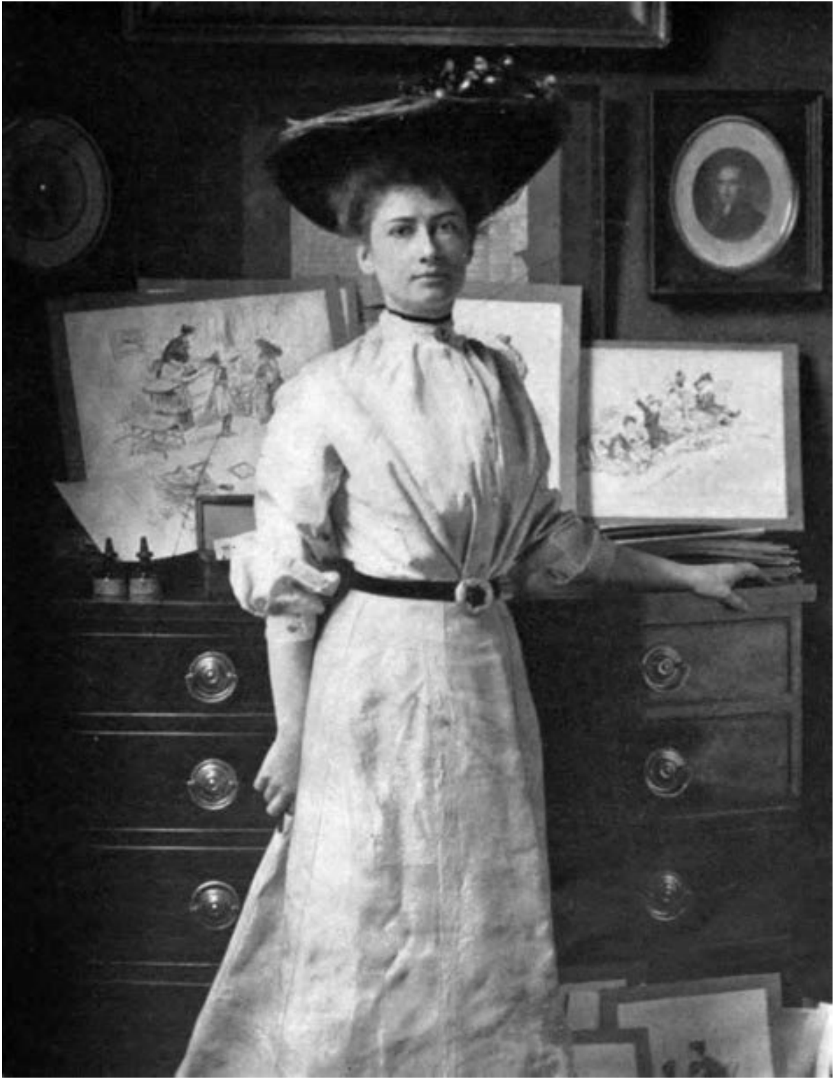
Florence Scovel Shinn